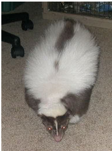
May 10, 2008 – Gandolf's first stomp